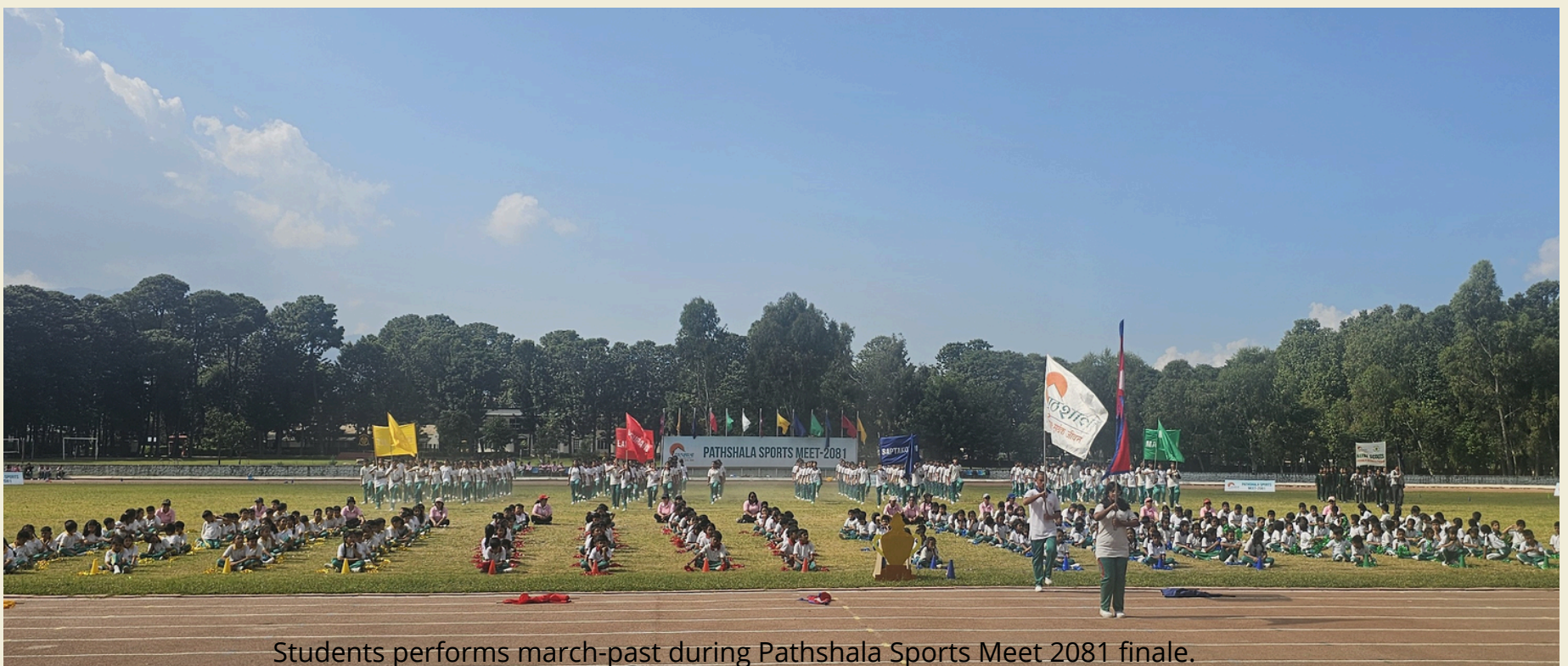
Students performs march-past during Pathshala Sports Meet 2081 finale.

Grade IX students participated in the Sports Meet 2081, which took place on the 12th and the 14th of Kartik, 2081. The event included various races and field competitions, march-past and PT drill.