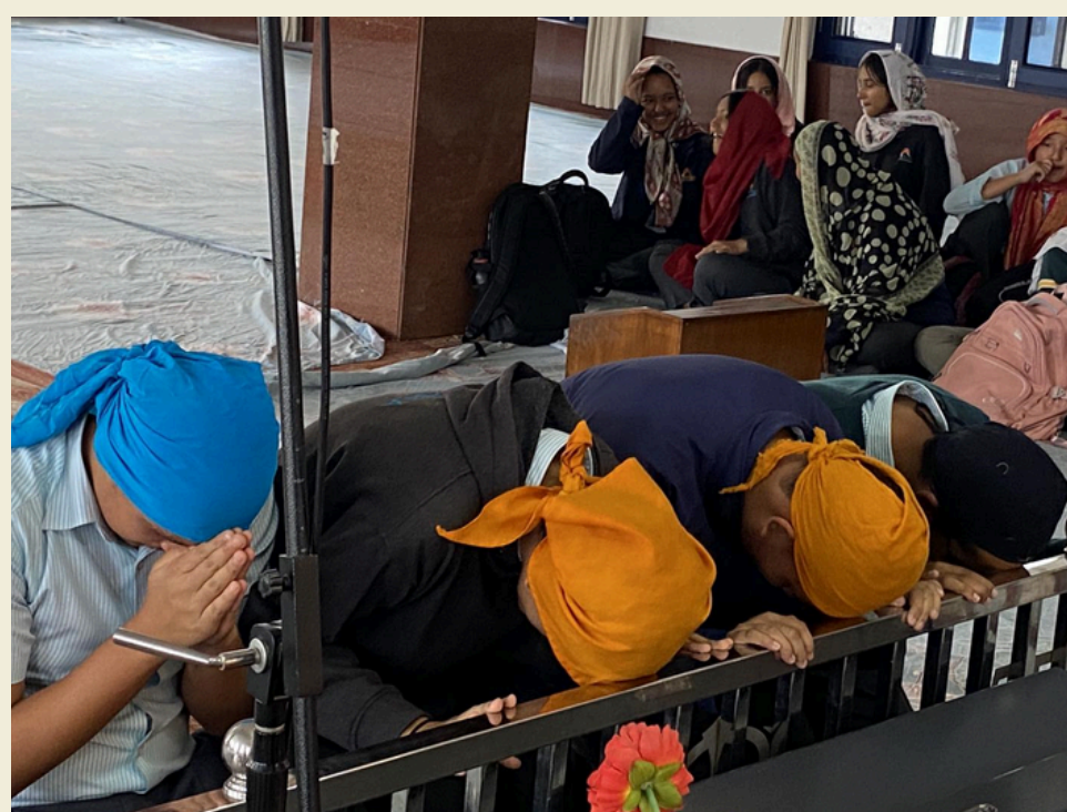
A few glimpses of Gurudwara Visit.