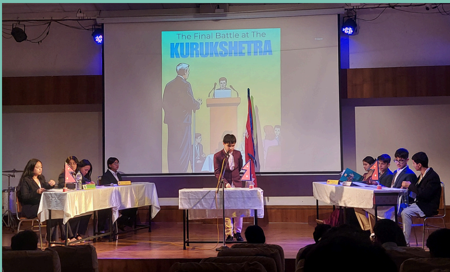
Students engaged in discussions during the debate competition.