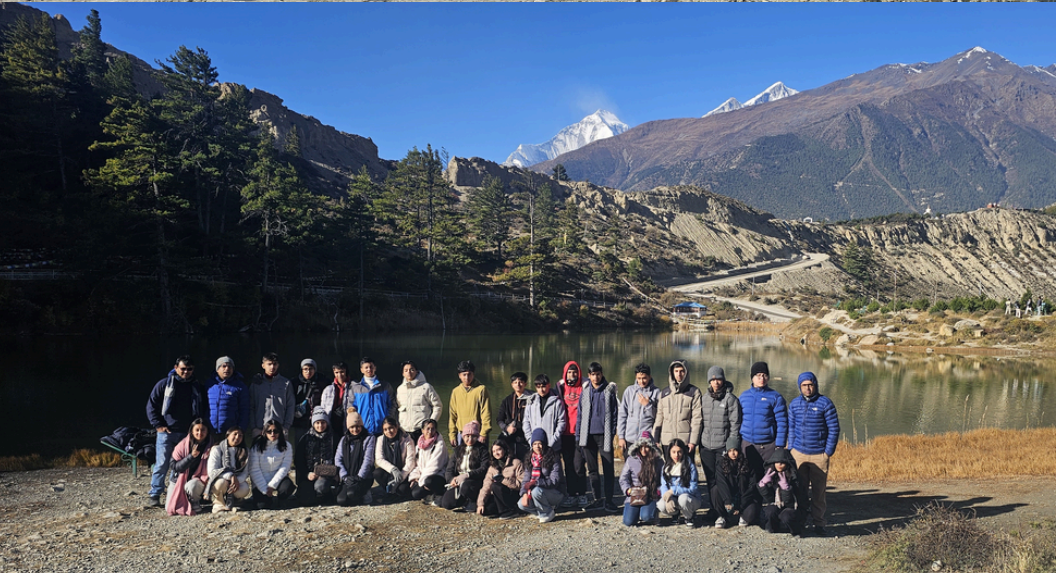
A few glimpses of Upper Mustang Tour.