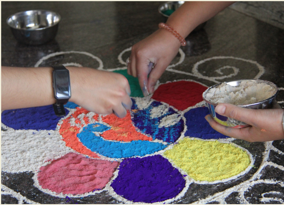
Students' hand at work, filling the rangoli with colors.