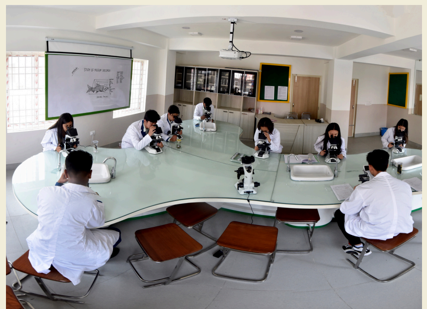
Students performs biology practical in School's laboratory.

During this period, students will be evaluated based on their classroom activities, regularity, performance in class tests, and home assignments.