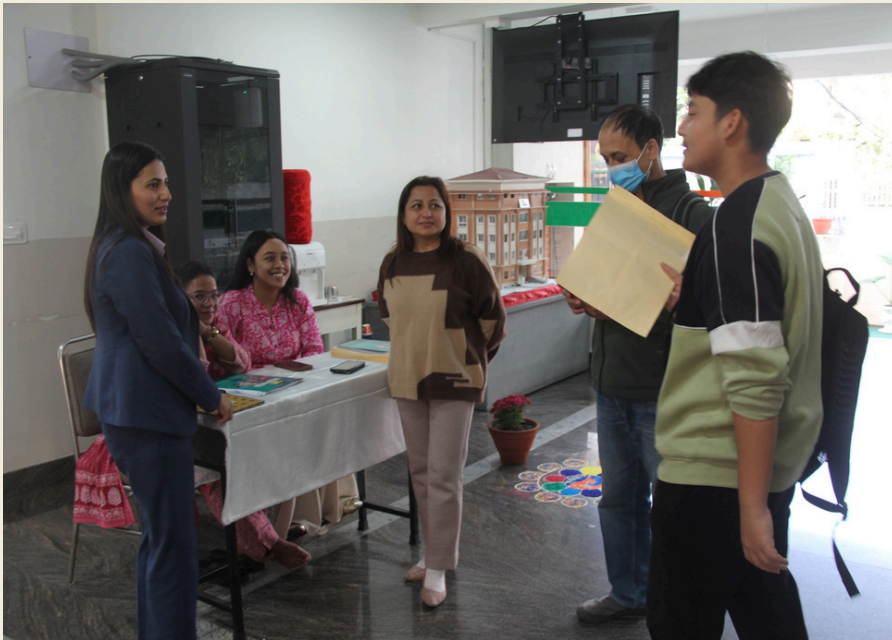
Pathshala Pre-Uni Admin Team distributes the results to parents.

We successfully held Parent-Student-Teacher Conference (PSTC-XI & XII) on Saturday, 5th Ashwin, 2081, following the completion of the First Terminal Examination 2081.