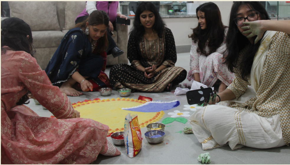
Students take part in rangoli-making competition.

Grade XI and Grade XII students participated in a rangoli-making competition as part of the Tihar celebration.