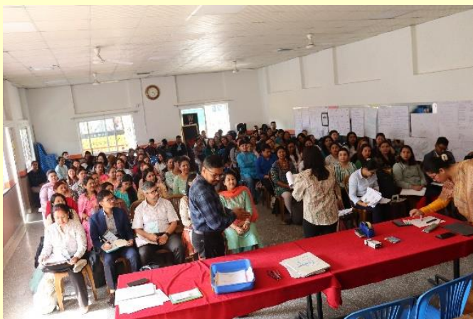
First Week Activities-Exhibition